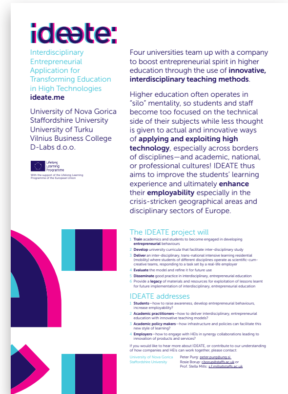
Left: aims and objectives flyer. Above and right: aims and objectives posters.