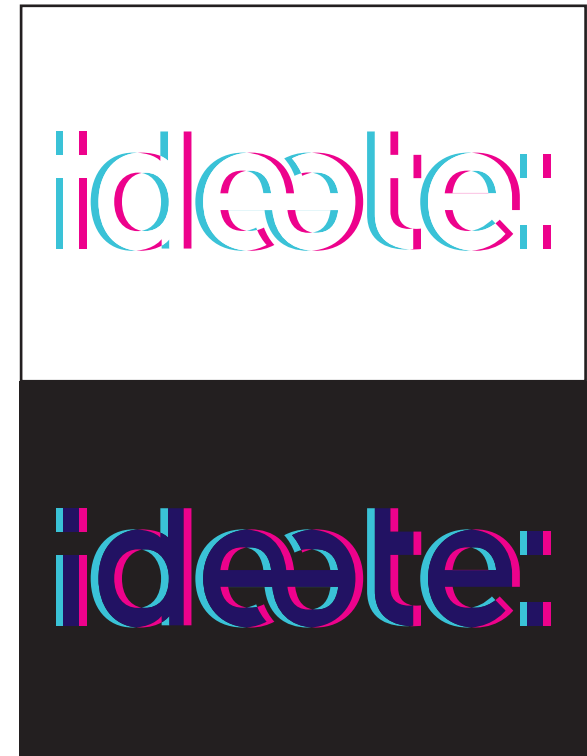
Negative version on white background and positive version on negative background.